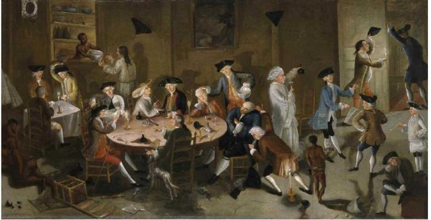
Sea Captains Carousing in Surinam by John Greenwood, 1755